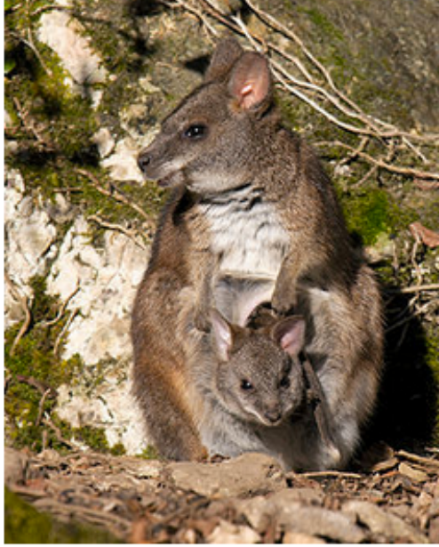
Macropus parma cum catulo in horto zoologico Salisburgensi versans